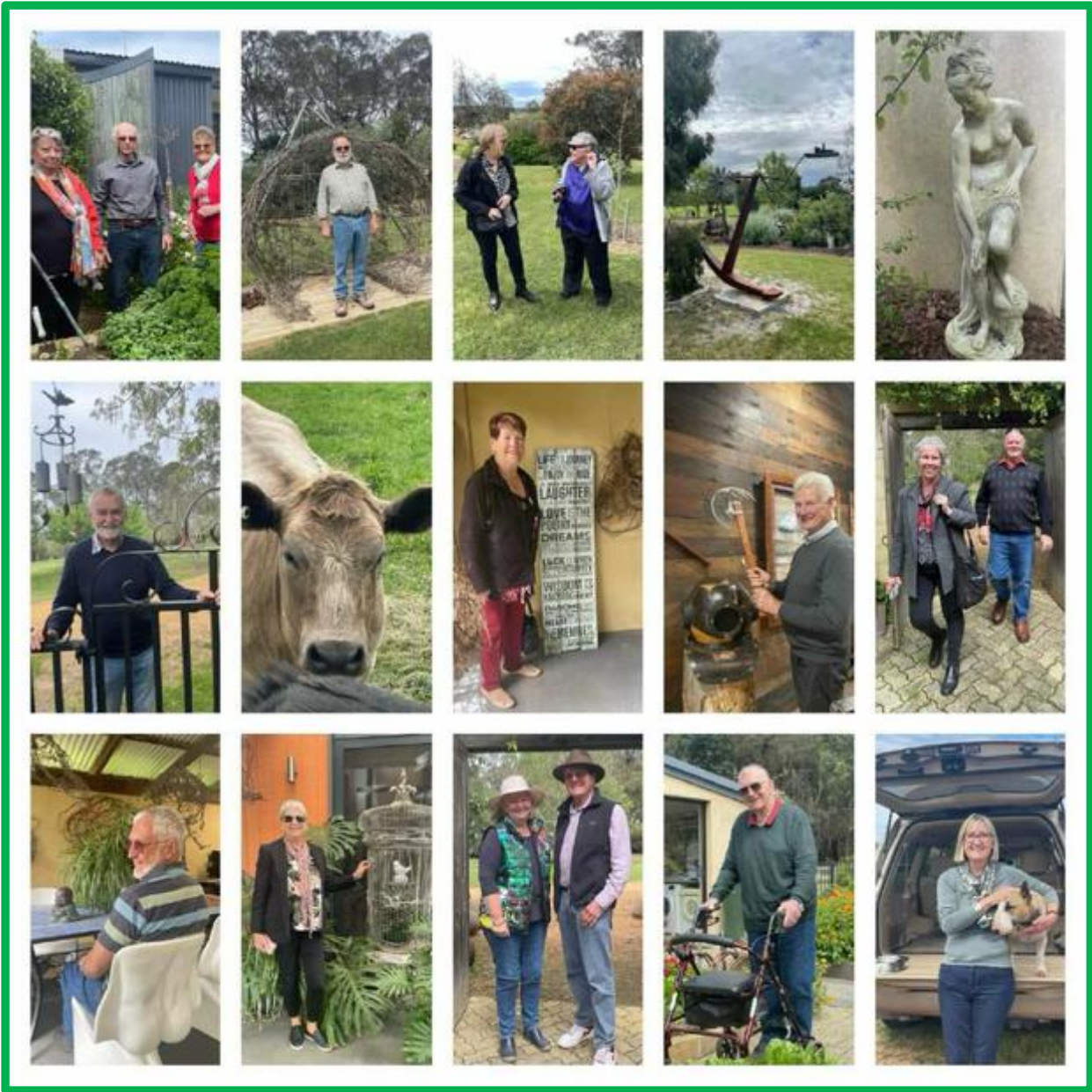
We enjoyed the Japanese garden and teahouse, the phone box at the edge of the world where you can send a message to a loved one who has passed, red Torii gate and black circular moon gate.