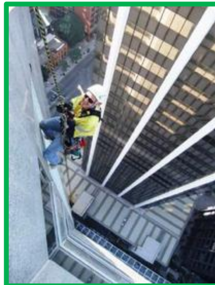
39 storeys above St George's Terrace, Perth

Barry still volunteers with the SES Vertical Rescue Squad, which involves abseiling down cliffs to rescue people trapped in hard to reach places or sometimes to retrieve a body.