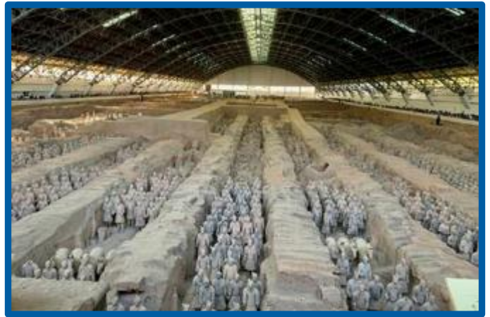
The terracotta warriors in real life. Wow!