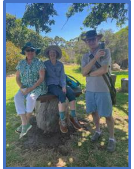
Cross club conversation