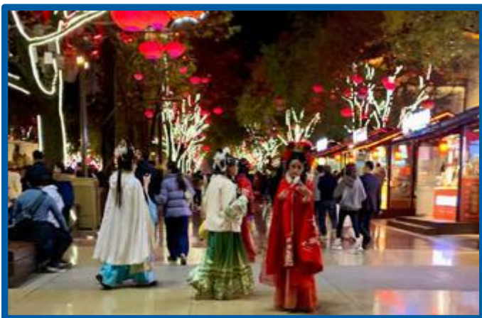
Xian at night