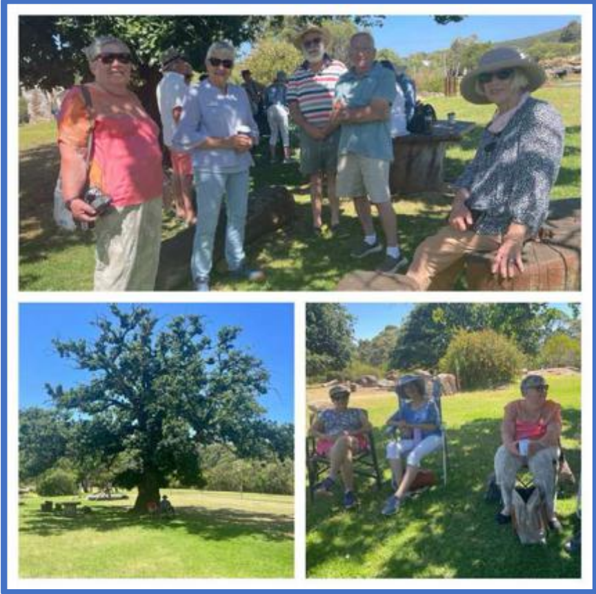
Enjoying each other's company