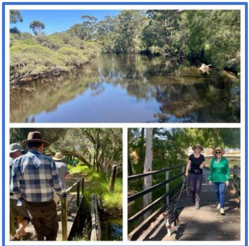
River views + good company