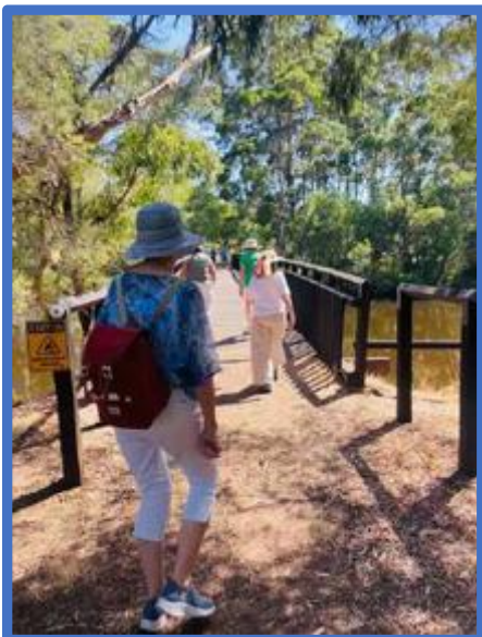
Setting off in sunshine

Chairs were gathered in a circle, morning tea was shared, and there was no shortage of compliments for the lemon cake and peach and raspberry slice - one from each club - enjoyed by all.