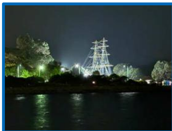
Shari's photo of the Amity lit up for Lighting the Sound