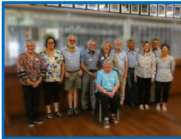
Committee photos Then & Now ~ 2014 & 2026