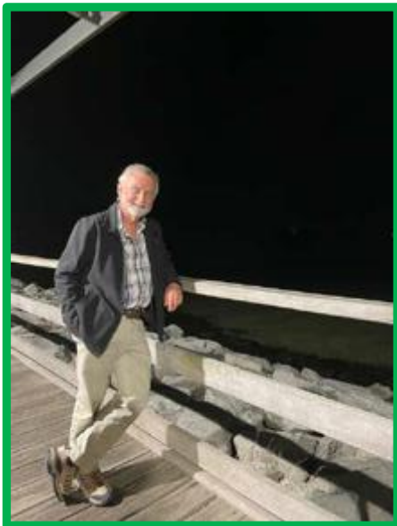
The Birthday boy

Most of all, it was a pleasure to share the experience together. With good food and conversation, it was a happy night out for our club. Many thanks again to Mal for organising such a memorable outing and ensuring everything ran so smoothly.