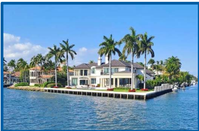
Fort Lauderdale, Florida