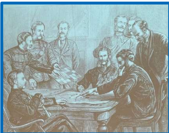
Prussian army officers playing Kriegsspiel