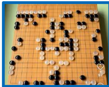
The game of Go, attributed to Chinese Emperor Yao