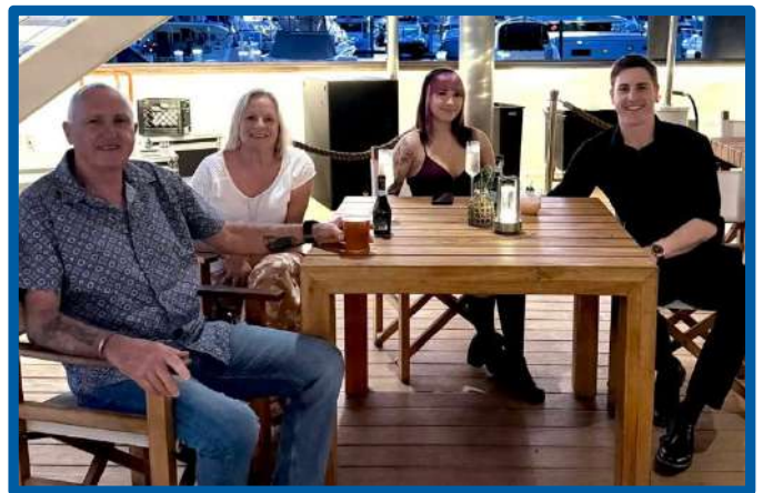
Pre-dinner drinks on their Bahamas cruise