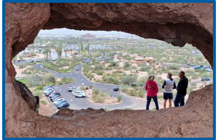
Hiking in Arizona with Callum