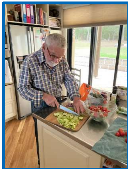
Inhouse lunch - our President leading by example