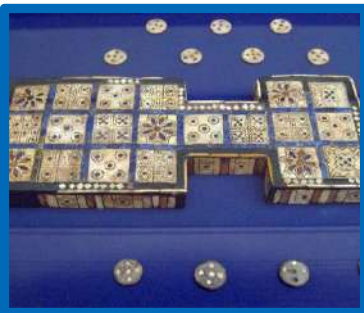
The Royal Game of Ur inlaid with lapis lazuli