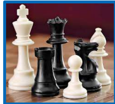
Chess, a game of strategy not chance