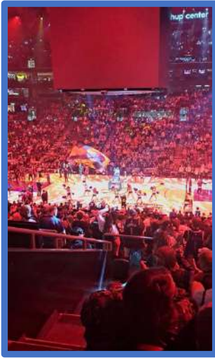
Halftime show at a basketball game