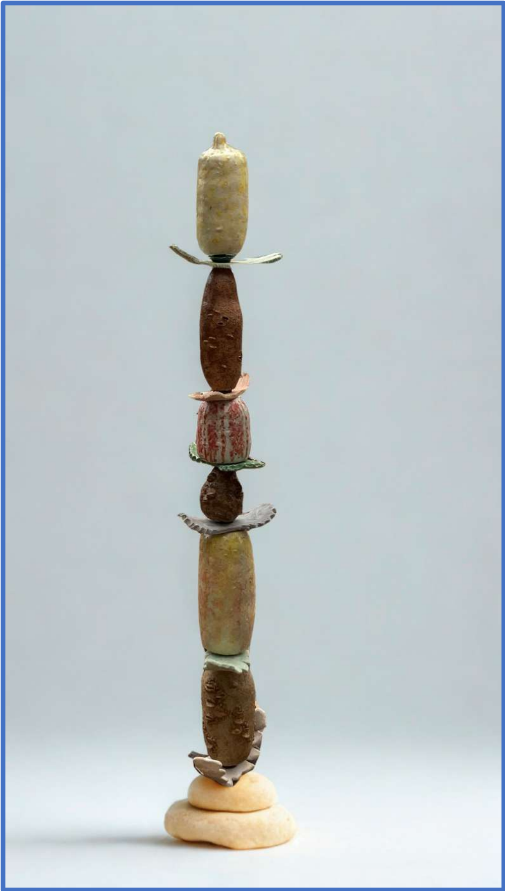
Banksia Sentinel ~ Rosemary's beautiful sculpture at the Porongurup Art in the Park exhibition